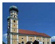
Pilgrimage Church Gartlberg

We cordially invite you to the 2nd Rottal Chess Open and wish you an exciting and successful chess tournament in the district of Rottal-Inn!