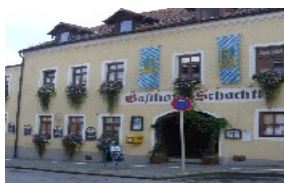
Guest House Schachtl