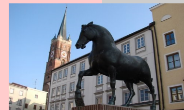
Pfarrkirchen, Rottal region